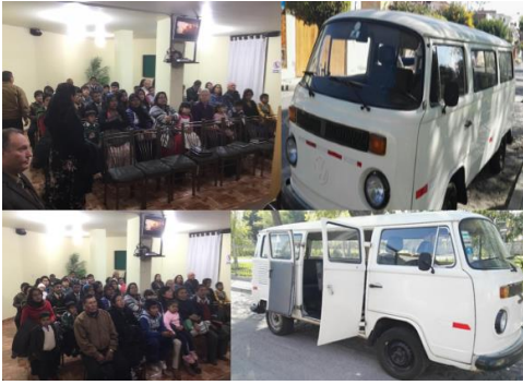
Nights during our revival and the church's mini-van