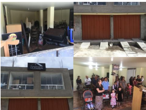
Move and first service in the new building

We want to ask you to please pray for different programs that we will be starting in the month of March. Lord willing, we will start working with children, adolescents and teens. Last year, we had to cancel our programs on Saturday mornings with the children and adolescents because there was a government order that everyone had to go to